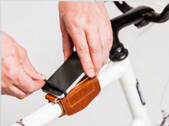
Silicone bands stretch to hold any smartphone tightly

Thurman is a minimalist, stylish, durable and pocketable way to attach almost any smartphone to almost any bike; listen to music or use maps as you ride.