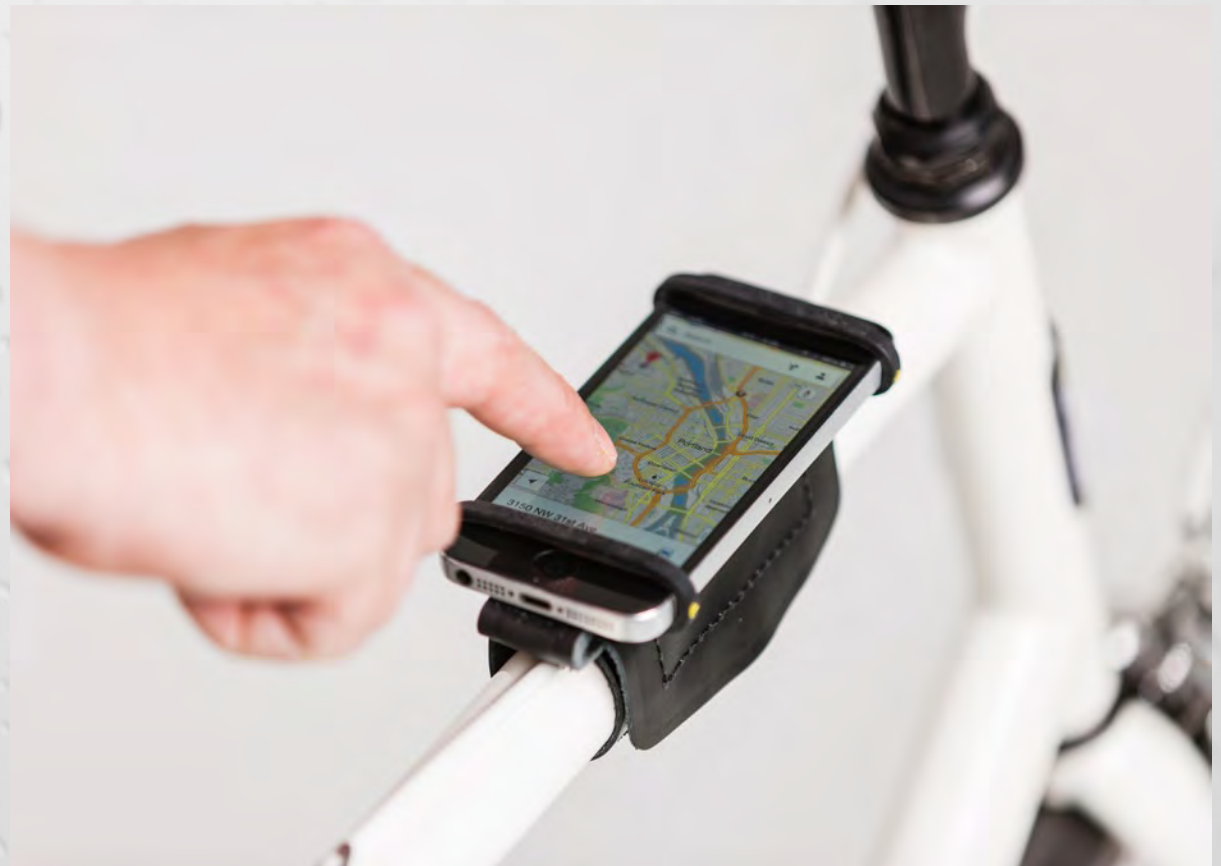
Silicone band position can be easily adjusted to not block the screen

TH1 - English Bridle Black TH2 - Oiled Chestnut Brown