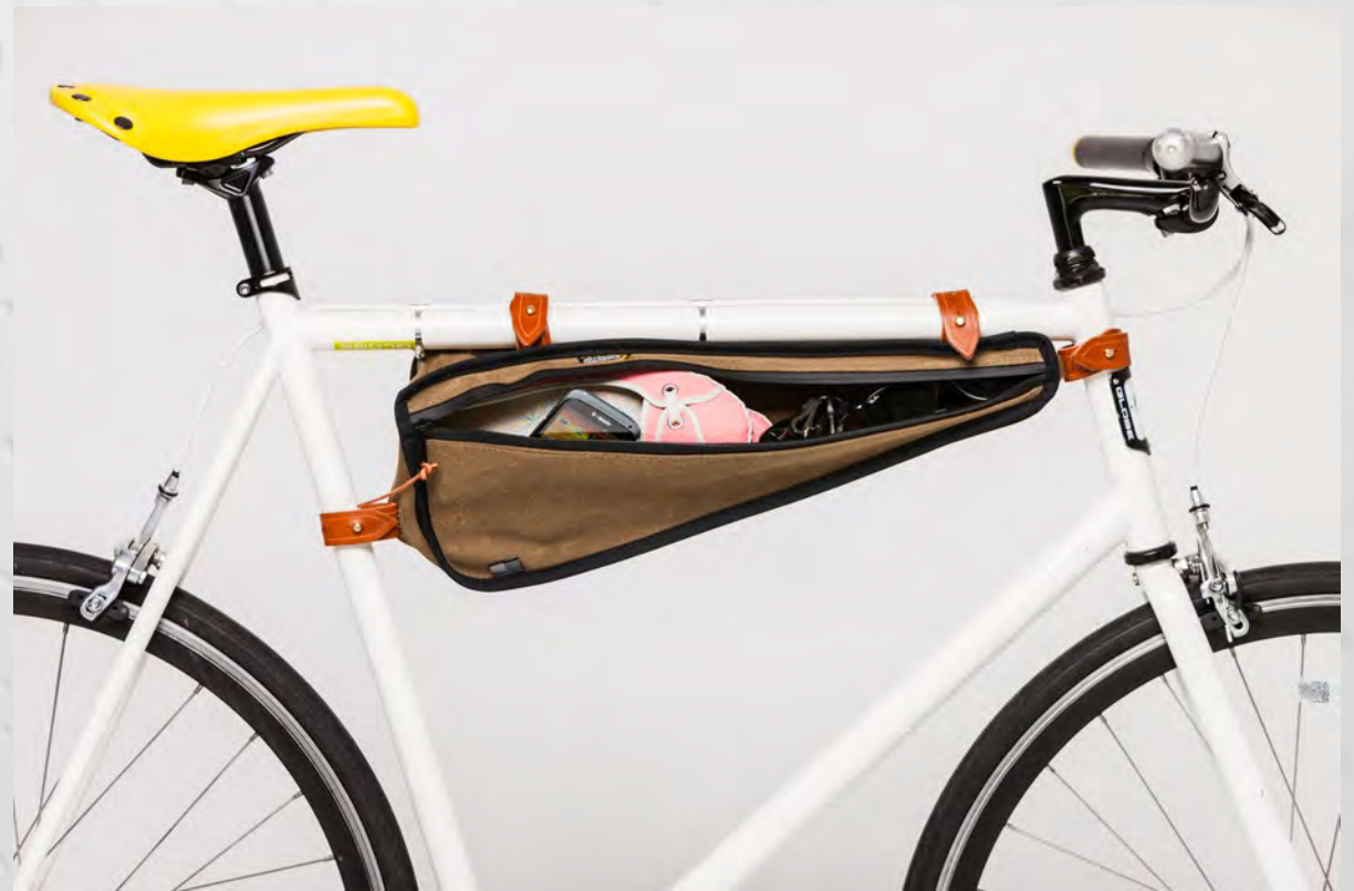
Carry commuting gear without getting a sweaty back like backpacks or messenger bags