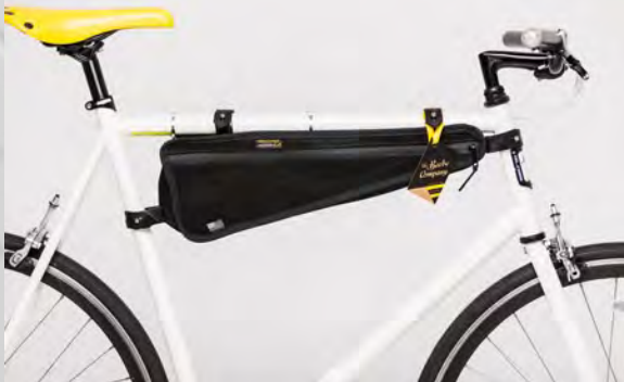
High quality water-resistant shielded UR zipper

The Leif adds a durable, lightweight, and useful frame pocket - instant cargo utility - to almost any bike.