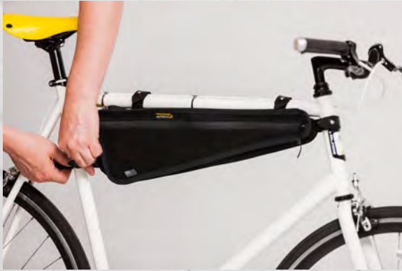
Easy to attach