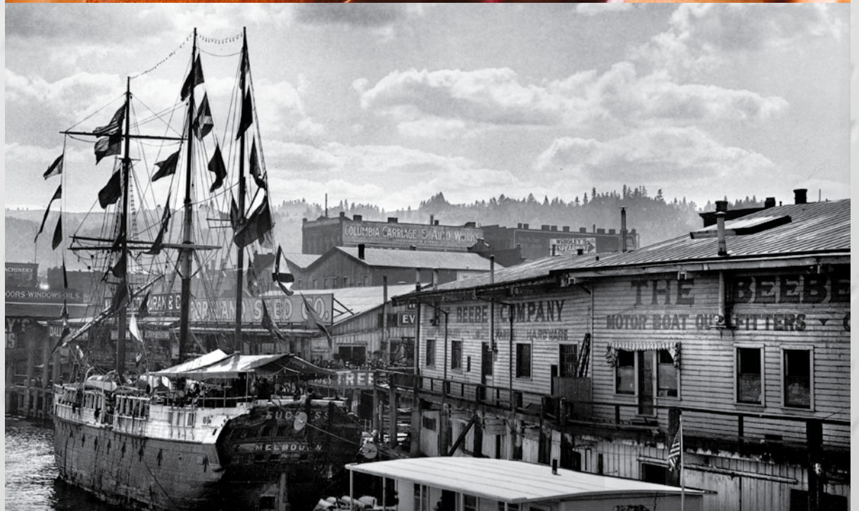
One of the original Beebe Company buildings on the Portland waterfront circa 1919.