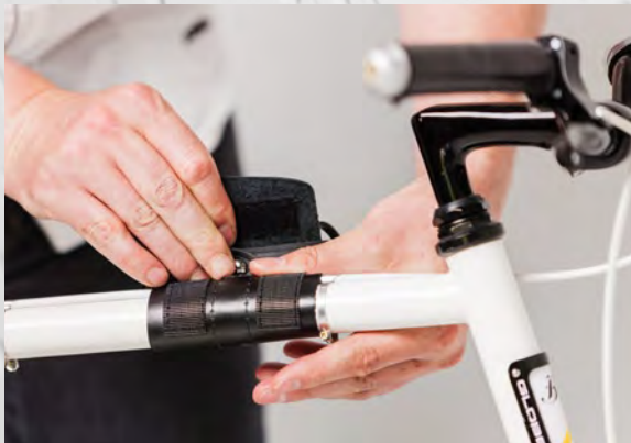
Be sure to wrap tightly around top tube