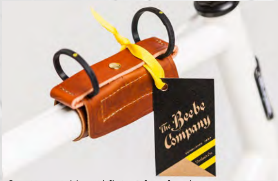
Creates a stable and flat surface for phone