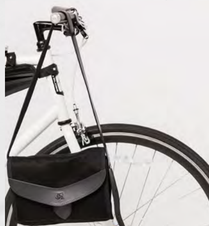
Removable & adjustable shoulder strap