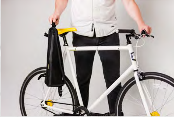
Easy to take with you