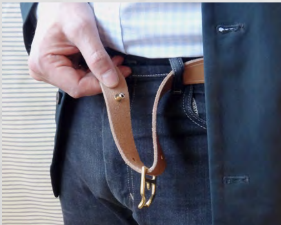
Length is adjustable with solid brass Sam Browne post