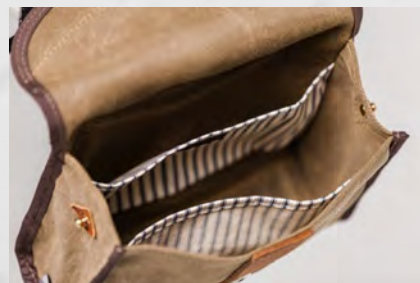
Two interior organization pockets