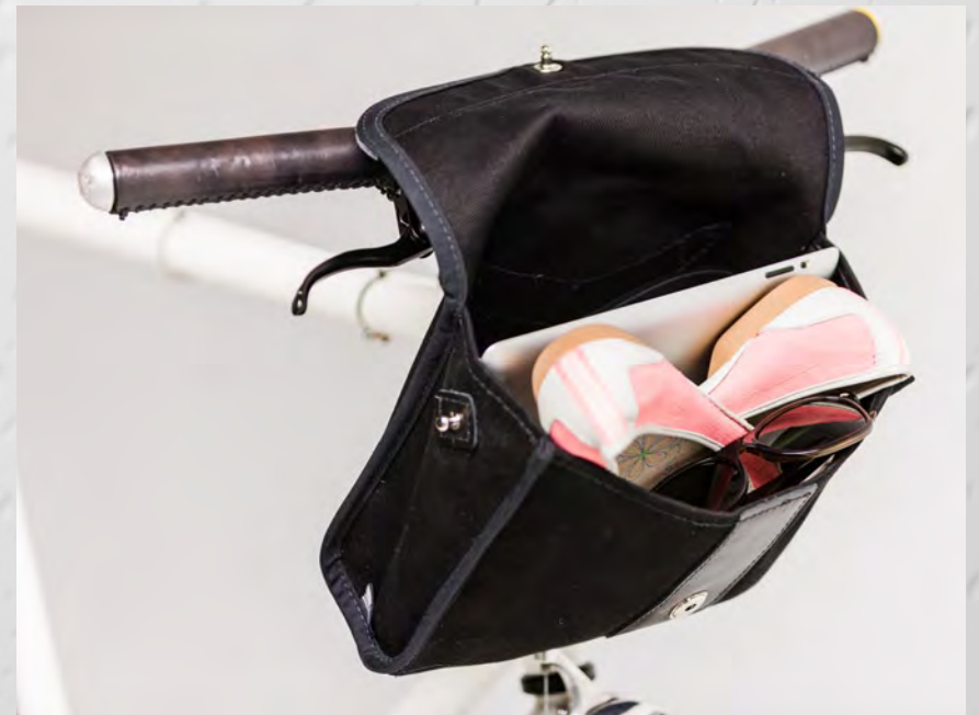
Comfortable commute with an iPad, extra shoes, etc. and still have your purse