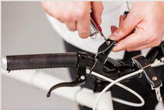
Wrap strap around handlebars and reattach snap